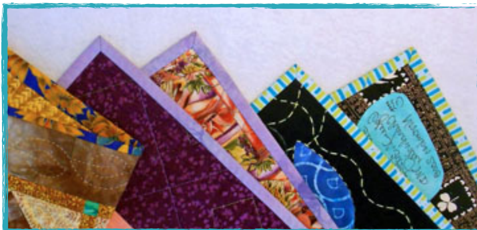
Bindings image from Bernina web site we all sew .