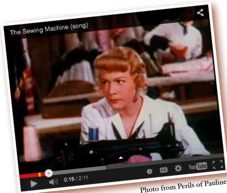
Photo from Perils of Pauline.