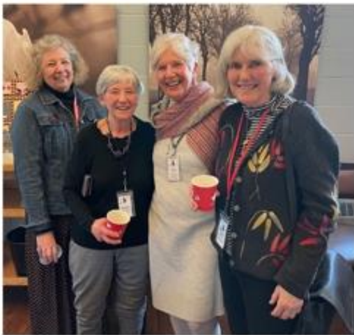
Ujamaa Grandmas special connections