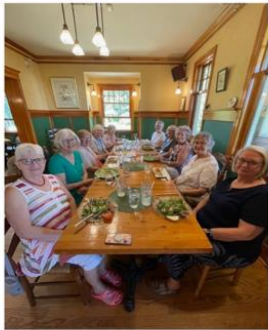
Lovely Luncheon at Reader's Rock Garden