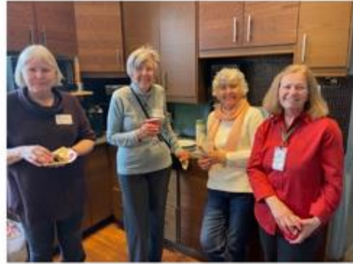
Beautiful Board members