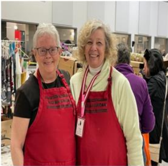
Smiling through sore feet!