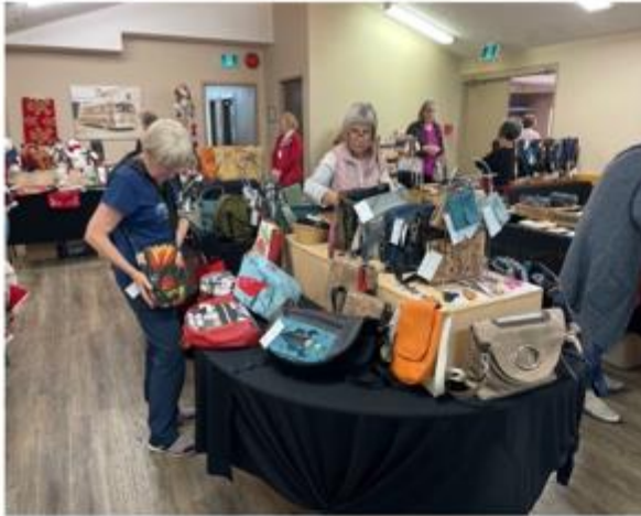
So many choices at the BB&B Sale!