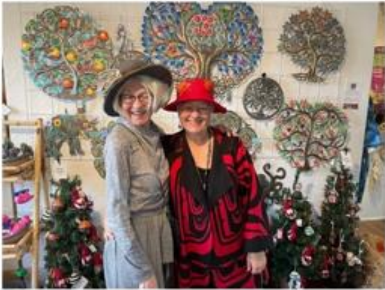
Having fun at the Villages Partnership