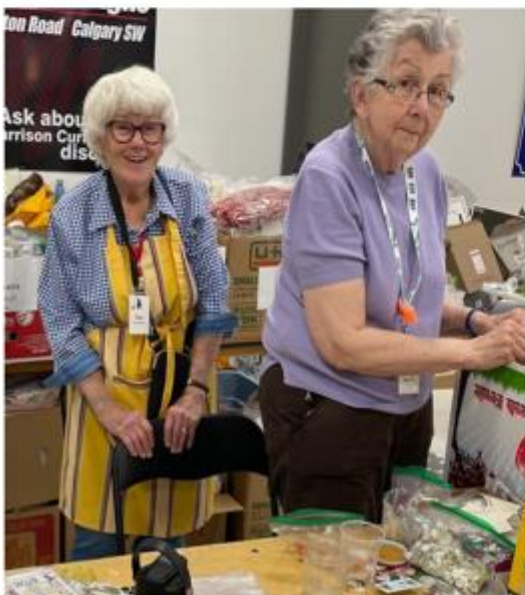
These ladies have a notion, or two!