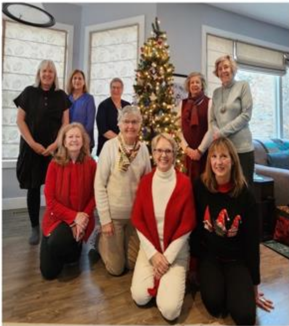
All 'aboard' for Christmas!