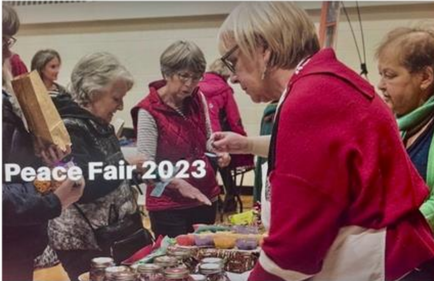
Calgary Justice Film Festival Peace Fair UG Bake Sale