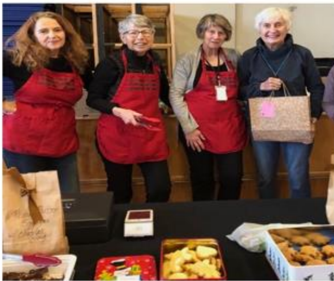
Our sweet Ujamaa Grandmas selling sweets at the Calgary Justice Film Festival Peace Fair