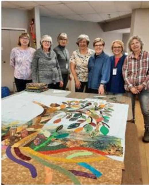
Anniversary Quilt Crew