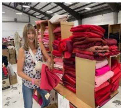
Time for a little shopping!