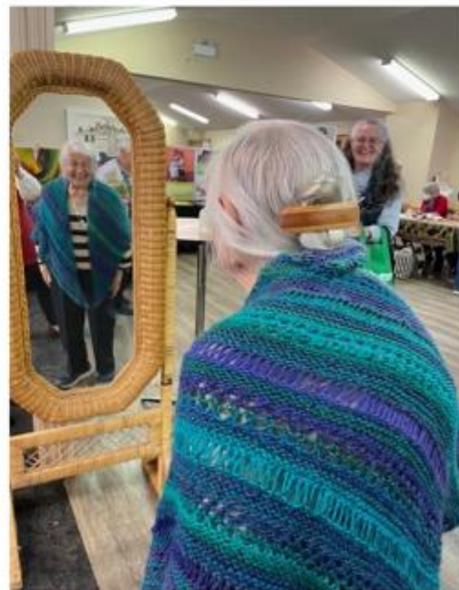
Gorgeous handiwork, gorgeous customer!