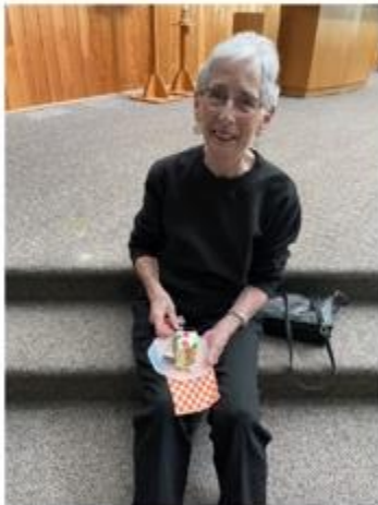
Party girl at a Monthly Gathering