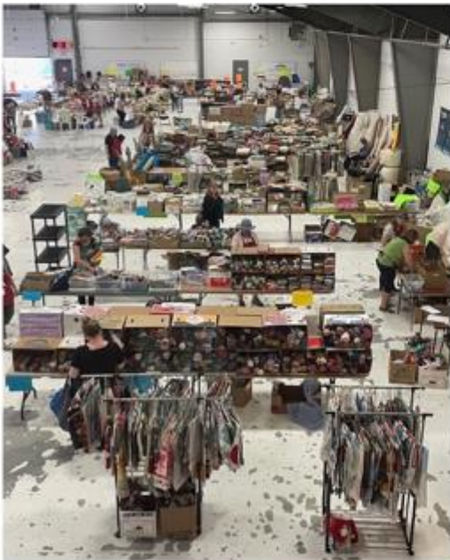
A treasure trove!