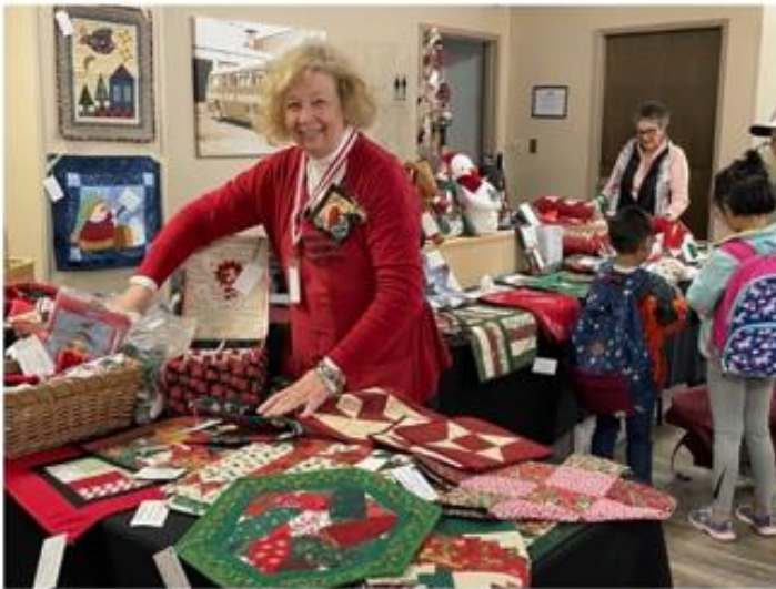
A warm and welcoming volunteer