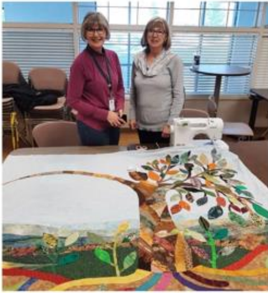
Appliqued leaves by our UG members