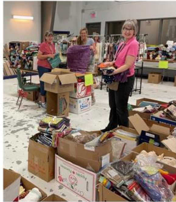
Hard at it at the Fabric & Yarn Sale