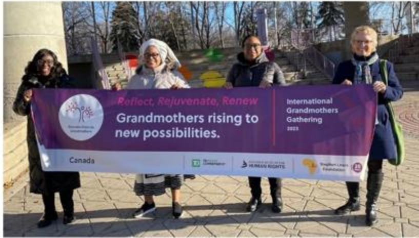
International Grandmothers Gathering in Winnipeg