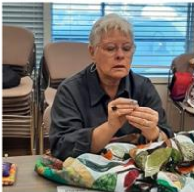
Skillful sewing on the anniversary quilt!