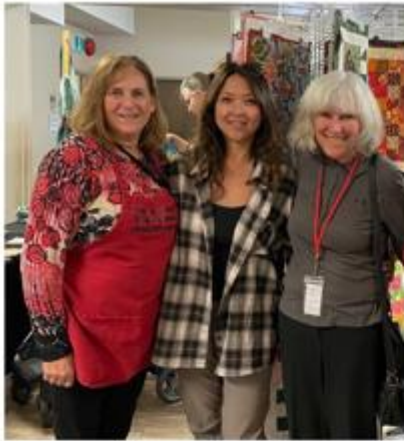
Bags, Babies & Beyond Sale