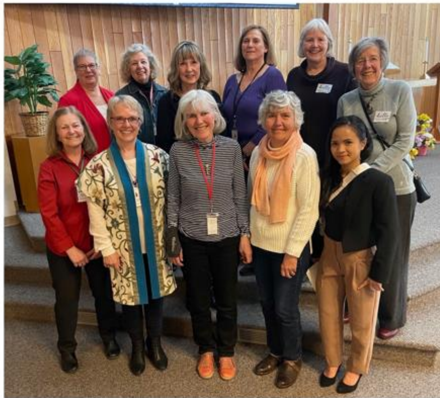
Your UJAMAA GRANDMAS Board; so proud to represent you!