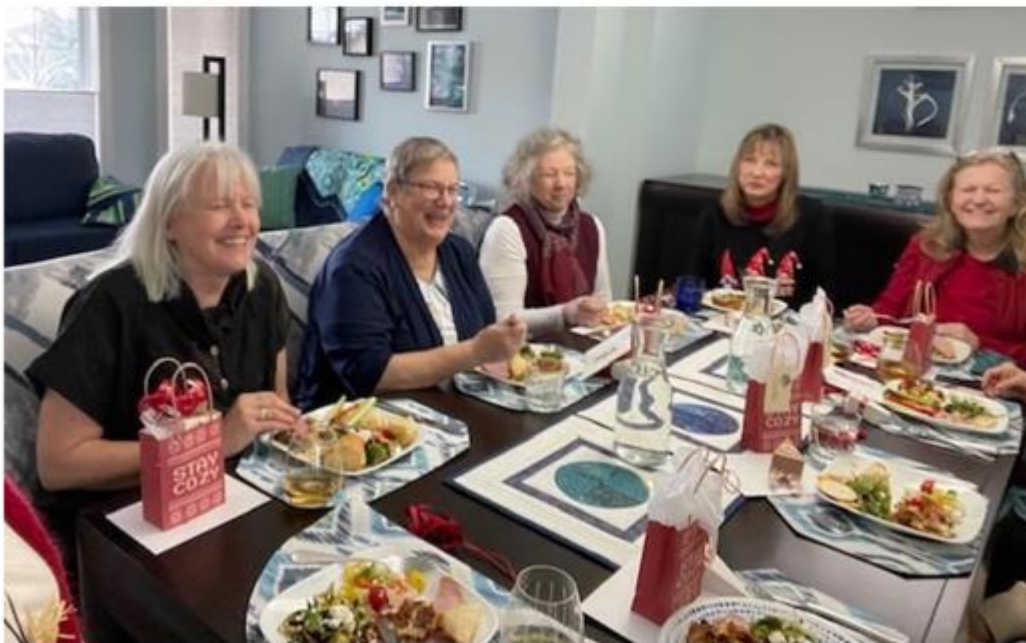
Lots of laughs at the UG Board Christmas meeting and luncheon