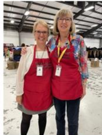
Happy gals at the F & Y Sale