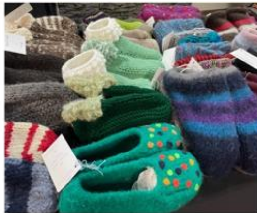
Fabulous work by our talented members