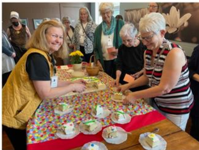
This calls for a celebration!