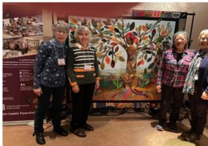
The completed quilt on display in Winnipeg