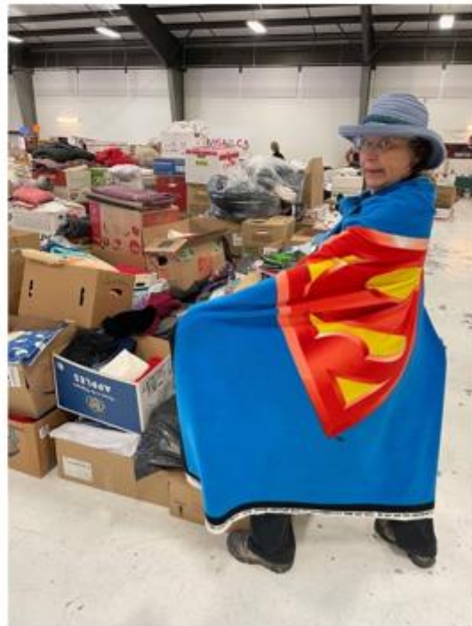
This type of organization takes superpowers!!