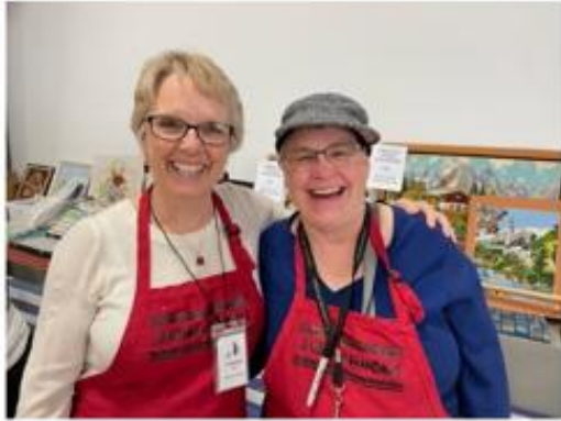
Just keep smiling!