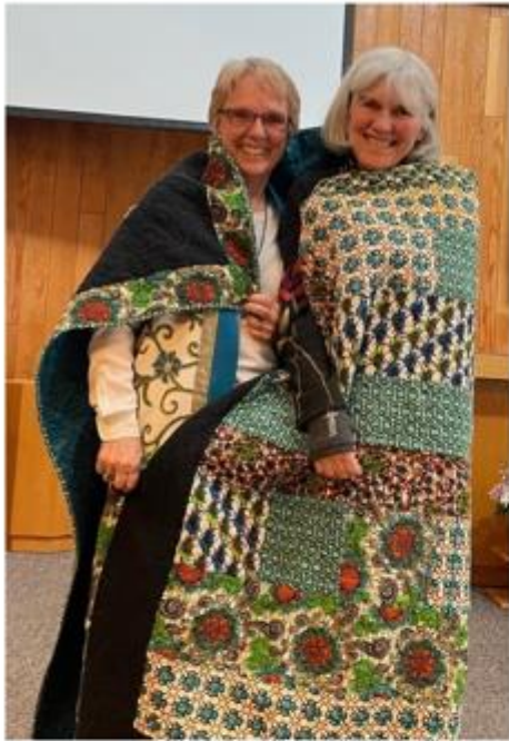
Celebrating one of our founding members