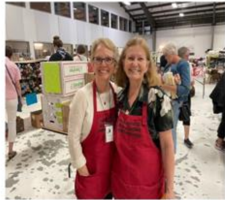
Ujamaa Grandmas Forever!