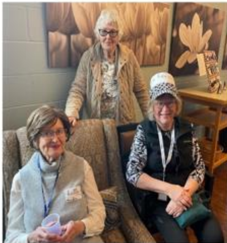
Gearing up for Stride to Turn the Tide!