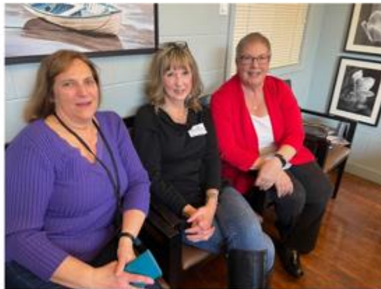
Beautiful Board members at a gathering