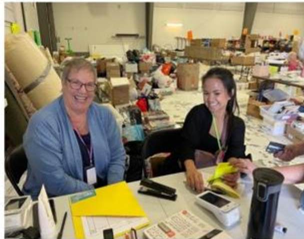
It's always good when the finance gals are smiling!