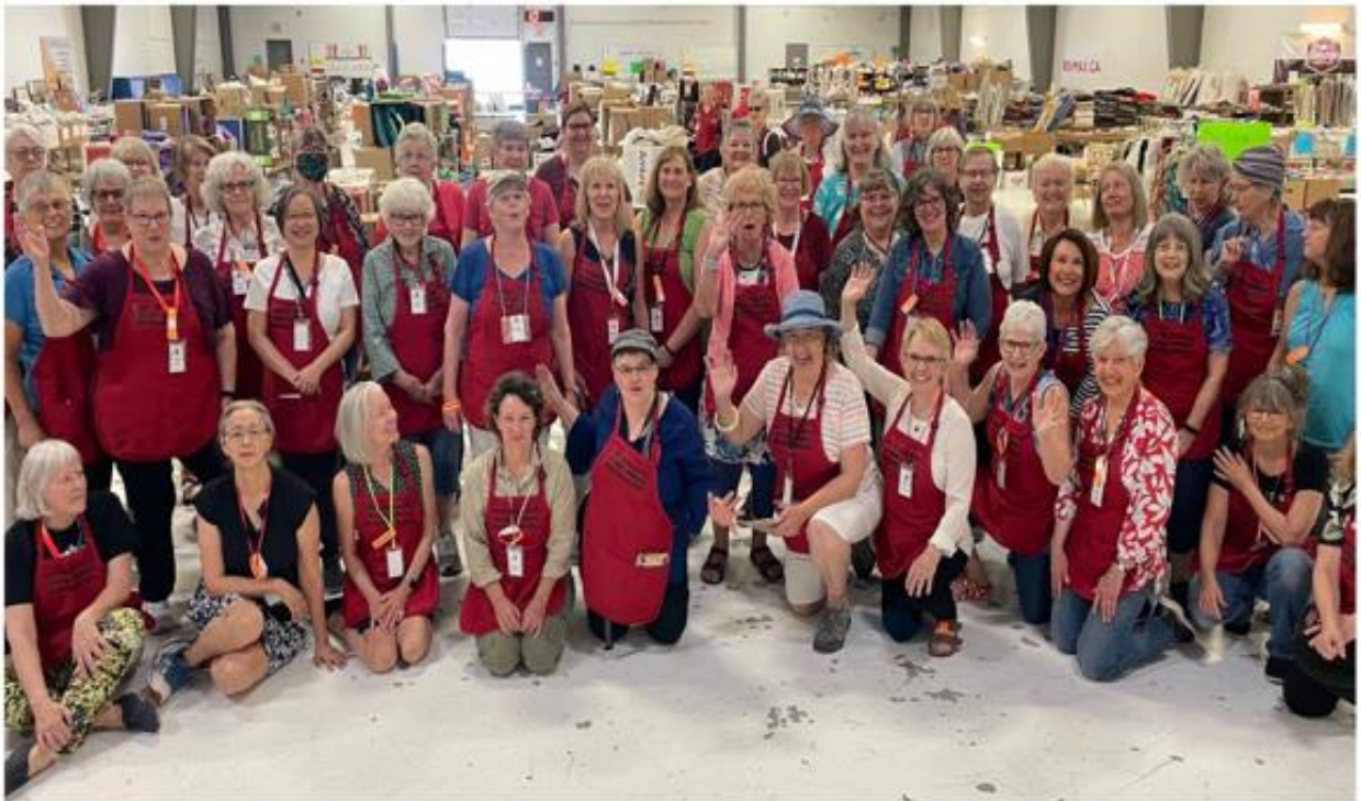
Some of the many, many volunteers who contributed to the successful Fabric & Yarn Sale