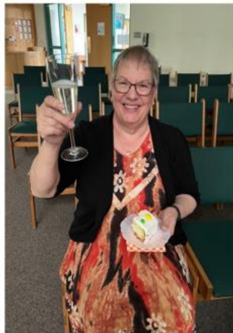
Her smile says it all!