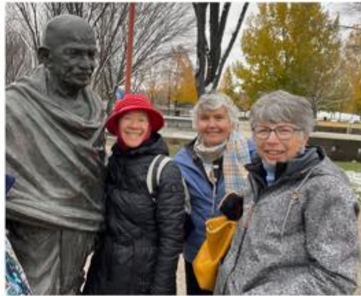
International Grandmother's Gathering in Winnipeg