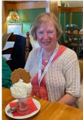
An ice-cream kind of day!