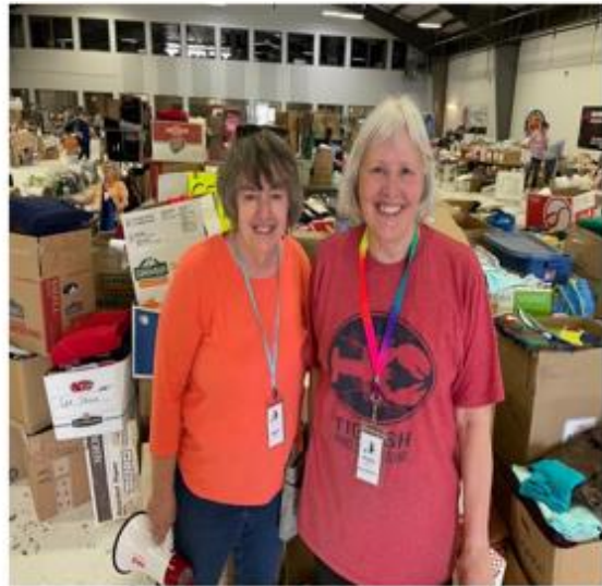
A Dynamic Duo!